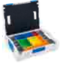
LB 102 IBS H3 Part No. 121015574 Shallow insets

5 sizes to choose from, docking panel to secure into a vehicle