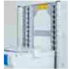
LB AP 20-54 Part No. 1000000624 Docking plate (without L-BOXXes)